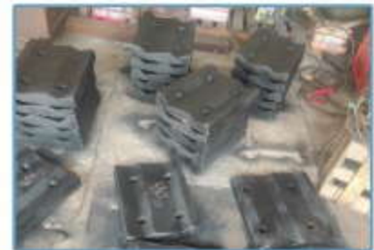
Gib Liner Plate (Straight & Curved)