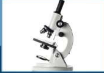
Microstructure Analysis (Microscope)