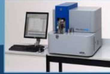
Chemical Structure Analysis (Spectrometer)