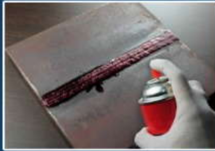
Dye Penetrant Testing