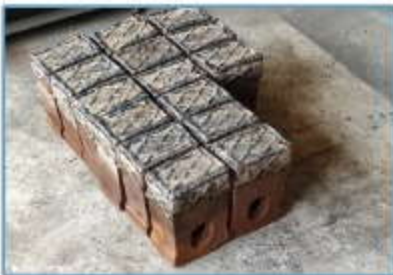
Hammer Head with Hard facing