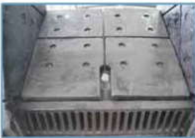
Quenching Car Liner Plate